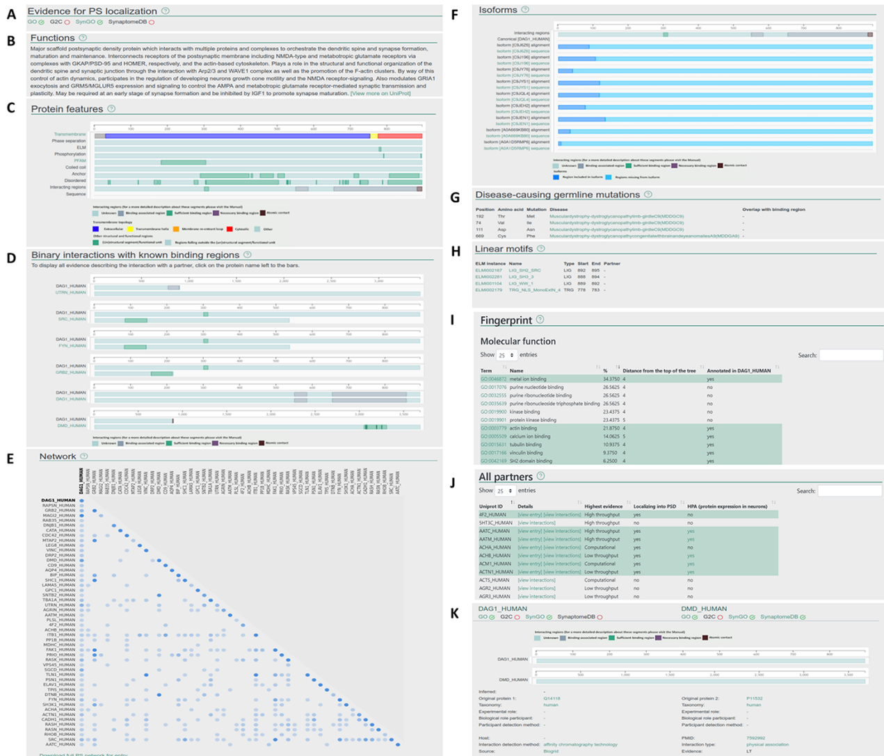
Figure 2. Layout of the individual entry pages (A–J) and the interaction pages (K) of PSINDB: Protein page: (A) Evidence for PS localization, (B) function, (C) protein features, (D) binary partners with known interacting regions, (E) network, (F) isoforms, (G) disease-causing germline mutations, (H) short linear motifs, (I) fingerprint, (J) all partners. Interaction page: (K) details of the experiment.

Clicking results from the protein search opens the individual protein entry pages, which includes a graphical overview of the corresponding protein along with 10 sections summarizing structural, interaction and network data (Figure 2A–J). The sections are as follows: (A) evidence for postsynaptic (PS) localization (with link to the source database) (B) function (short description mirrored from